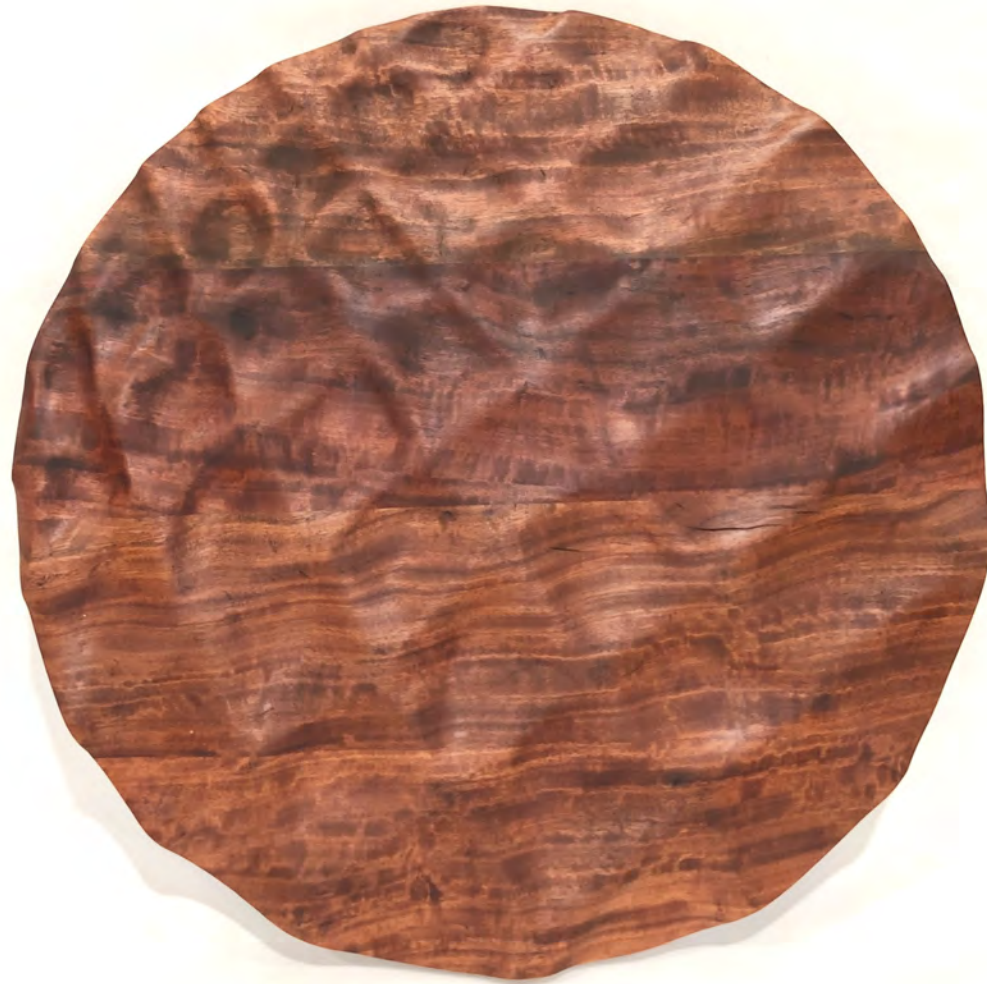
Where the creek widens Wall hanging, oiled jarrah 45cm $750