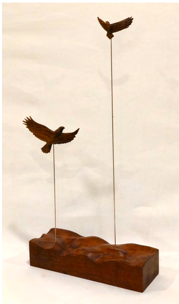
Eagles above my parent's place

Redgum, blackwood, stainless steel, oil 56cm x 30cm x 9cm $750